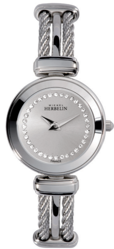
17125/B62 Ø 26mm