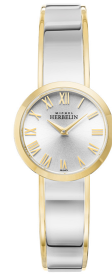
17056/BT21 Ø 28mm

Swiss Movement - Quartz 316L - Stainless steel Sapphire Crystal Water resistant 30 m.