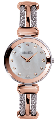
17125/BT4R59 Ø 26mm