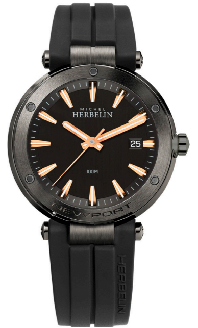
12288/G33TCA WR 100m Ø 43mm