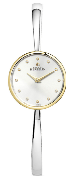
17408/BT52 Ø 26mm