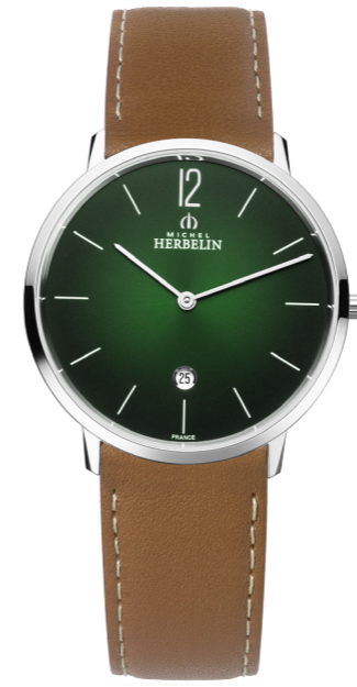
19515/16NGO Ø 38.7mm