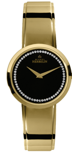
17082/BP64 Ø 31mm