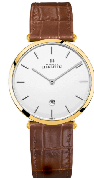
19406/P11GO Ø 38mm