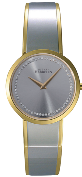
17082/BT62 Ø 31mm