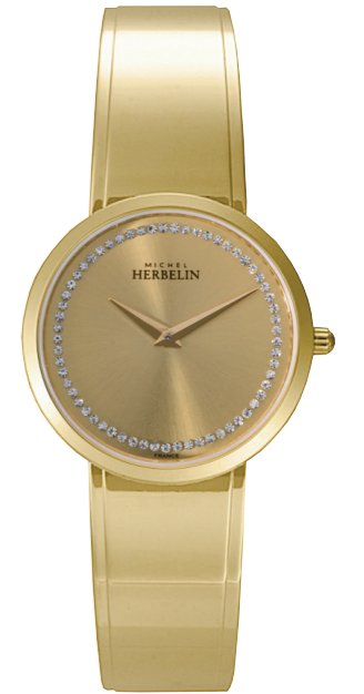
17082/BP63 Ø 31mm