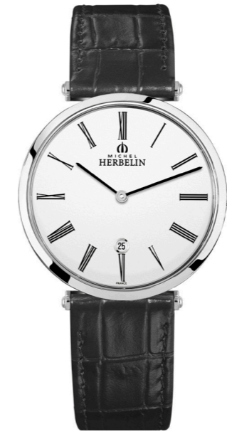
19406/01N Ø 38mm

Swiss Movement - Quartz 316L - Stainless steel Sapphire Crystal Water resistant 30 m.