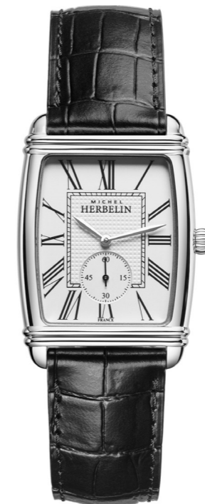
10638/08 Ø 30 x 35.5 mm

Swiss Movement - Quartz Stainless steel Quartz 6 3/4 X 8 Ronda1069 Sapphire Crystal Genuine Leather Hours, minutes, small seconds Water resistant 30 m.