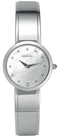
17056/B19 Ø 28mm

Swiss Movement - Quartz 316L - Stainless steel Sapphire Crystal Water resistant 30 m.