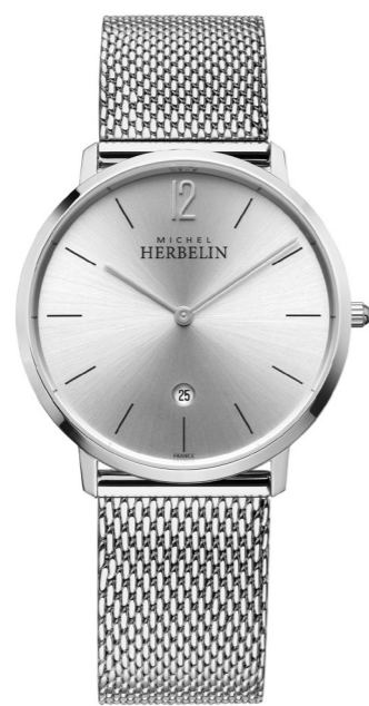
19515/11B Ø 38.7mm