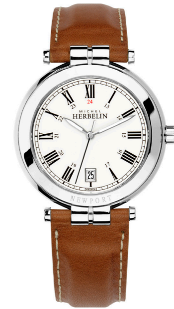
12254/AP01GO WR 50m Ø 39mm