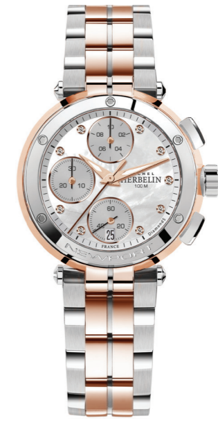
35688/BTR89 WR 100m Ø 34mm Diamond