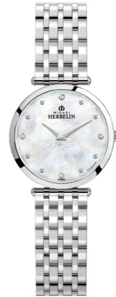
17116/B89 Ø 28mm

Swiss Movement - Quartz 316L - Stainless steel Sapphire Crystal Water resistant 30 m.