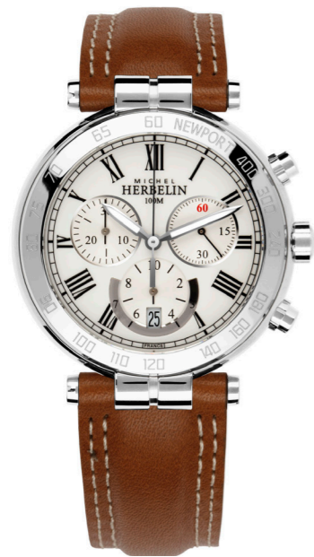
37654/AP08GO WR 100m Ø 40mm

Swiss Movement - Quartz Chrono 316 L- Stainless steel Sapphire Crystal Water resistant 100 m