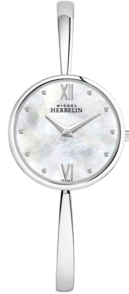
17418/B19 Ø 31mm

Swiss Movement - Quartz Stainless steel High Grade Gold PVD Sapphire Crystal Water resistant 30 m.