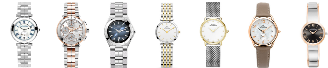
Newport Classics 16 Newport Chrono 14 Cap Camarat 20 Epsilon 27 City 34 Equinoxe 37 M-Band 39