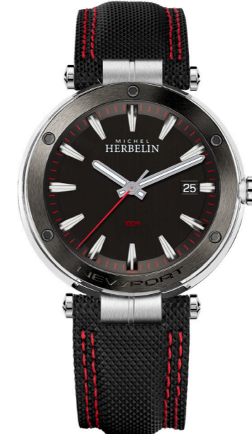
12288/AG44 WR 100m Ø 40.50mm