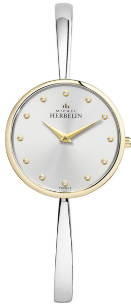
17418/BT52 Ø 31mm