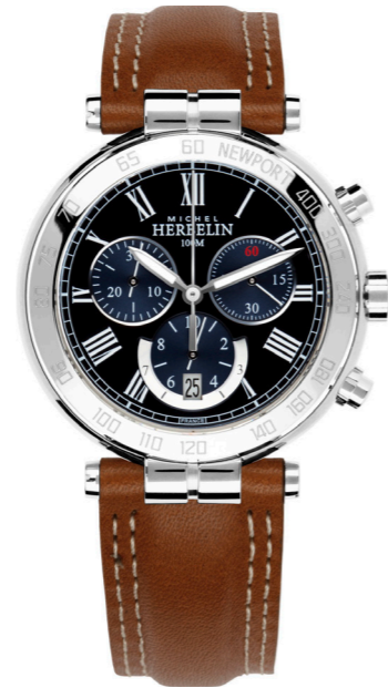
37654/AP04GO WR 100m Ø 40mm