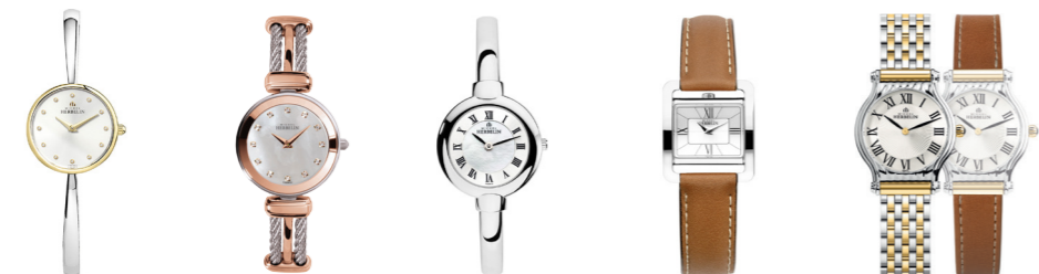
Scandinave 45 Câbles 49 Salambo 53 5th Avenue 55 Antarès 59