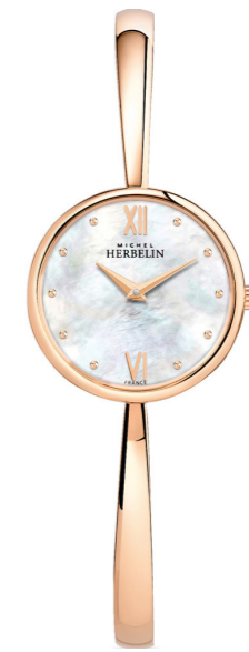
17408/BPR19 Ø 26mm