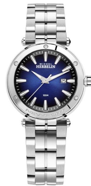
14288/B15 WR 100m Ø 34mm