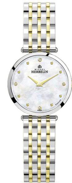
17116/BT89 Ø 28mm