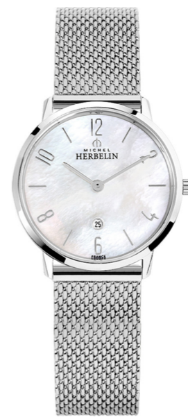
16915/29B Ø 30.5mm

CITY | Swiss Movement - Quartz 316L - Stainless steel Sapphire Crystal Water resistant 30 m.