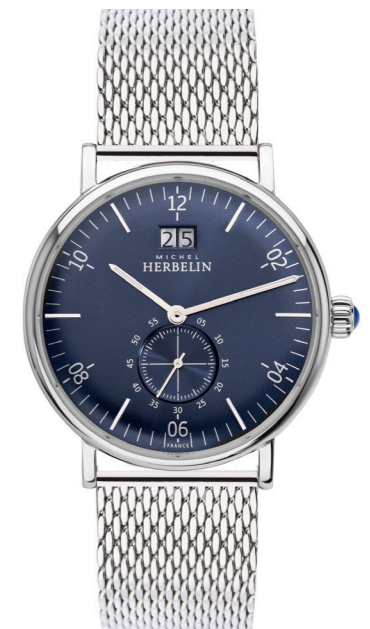
18247/15B Ø 40mm