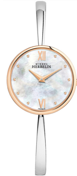
17418/BTR19 Ø 31mm