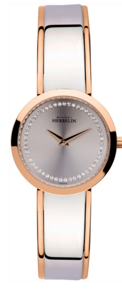
17056/BTR62 Ø 28mm