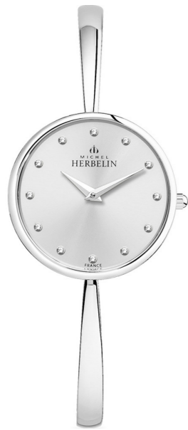
17418/B52 Ø 31mm