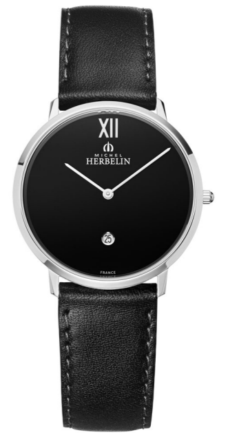
19515/04 Ø 38.7mm