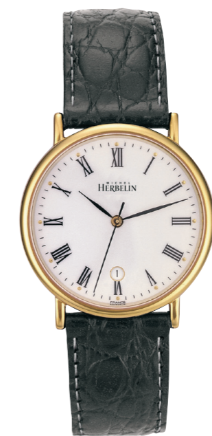
12443/P01 Ø 34mm