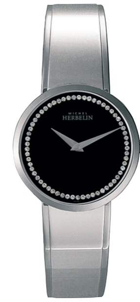
17082/B64 Ø 31mm