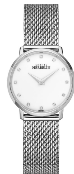
16915/51B Ø 30.5mm