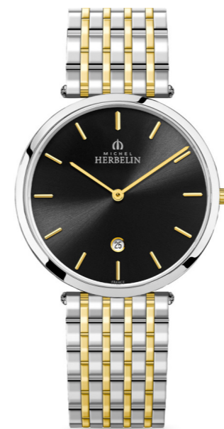
19416/BT14N Ø 38mm