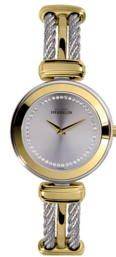
17125/BT62 Ø 26mm