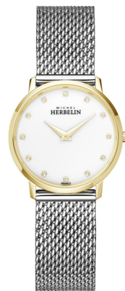
16915/P51B Ø 30.5mm