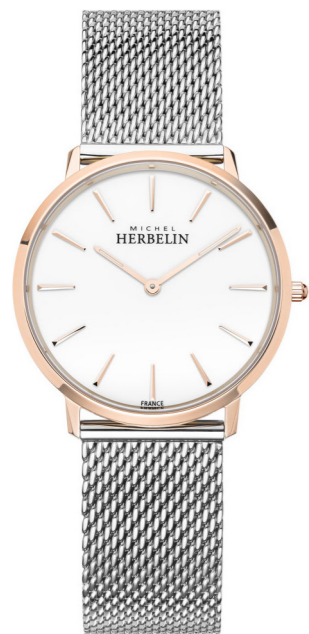
19515/PR11B Ø 38.7mm