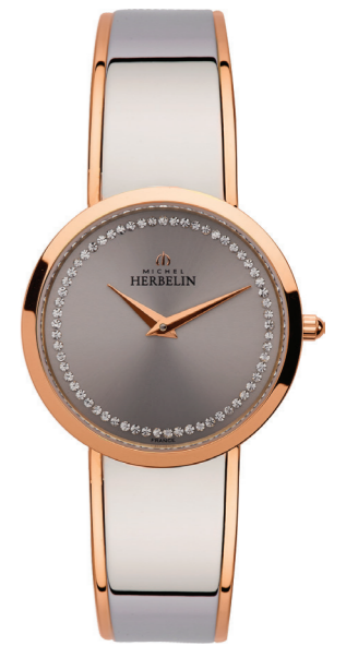
17082/BTR62 Ø 31mm