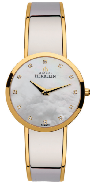
17082/BT59 Ø 31mm