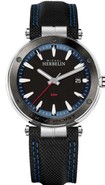
12288/AG45 WR 100m Ø 40.50mm

Swiss Movement - Quartz 316 L- Stainless steel Sapphire Crystal Water resistant 100 m