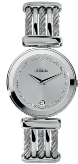
19415/B62 Ø 31.5mm

Swiss Movement - Quartz Stainless steel High Grade Gold PVD Sapphire Crystal Water resistant 30 m.