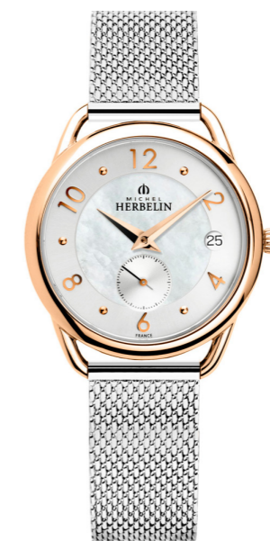
18397/PR29B Ø 34mm