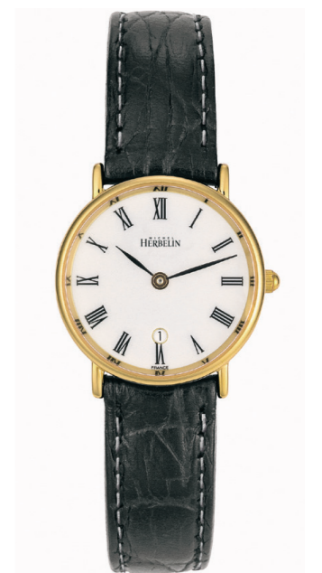
16845/P01 Ø 26mm

CITY | Swiss Movement - Quartz 316L - Stainless steel Sapphire Crystal Water resistant 30 m.