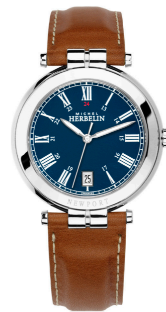
12254/AP05GO WR 50m Ø 39mm

Swiss Movement - Quartz 316 L- Stainless steel Sapphire Crystal Water resistant 100 m