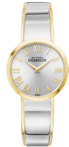
17082/BT21 Ø 31mm