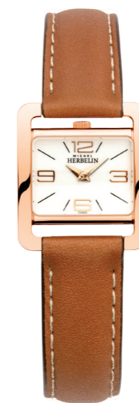
17137/PR11GO Ø 25.5 x 19 mm