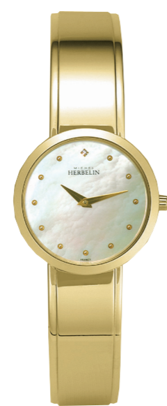
17056/BP19 Ø 28mm