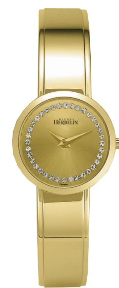
17056/BP63 Ø 28mm