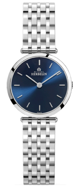
17116/B15 Ø 28mm