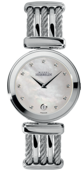
19415/B59 Ø 31.5mm