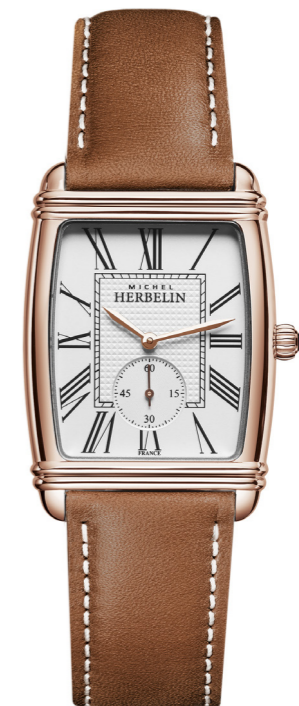
10638/PR08GO Ø 30 x 35.5 mm