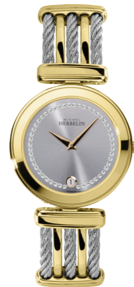
19415/BT62 Ø 31.5mm