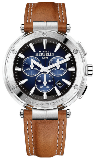
37688/35G0N WR 100m Ø 43mm