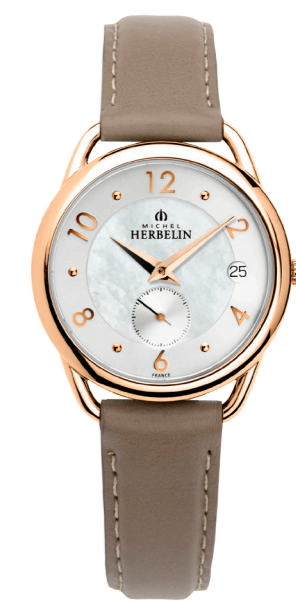
18397/PR29GR Ø 34mm