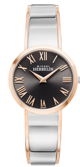
17082/BTR22 Ø 31mm