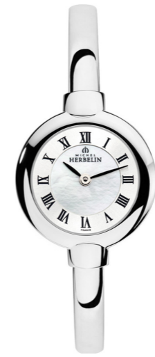
17413/B29 Ø 26mm

Swiss Movement - Quartz Stainless steel High Grade Gold PVD Sapphire Crystal Water resistant 30 m.