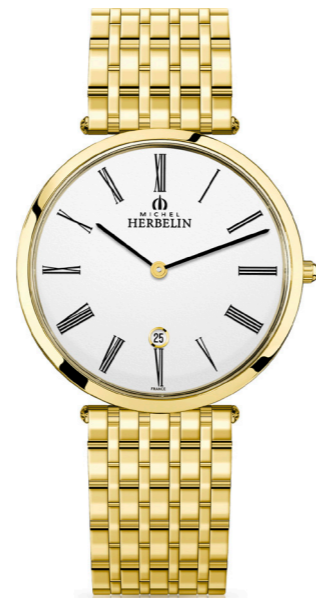
19416/BP01N Ø 38mm