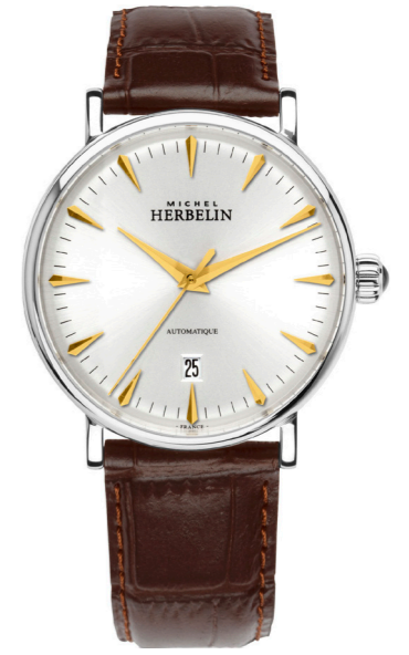
1647/T11MA Ø 40mm