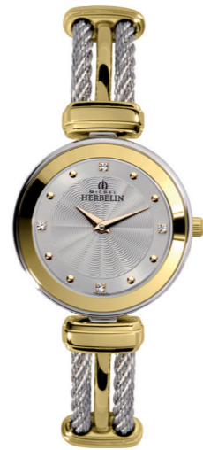
17125/BT12 Ø 26mm