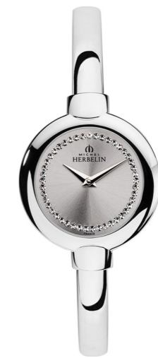
17413/B62 Ø 26mm