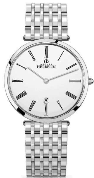
19416/B01N Ø 38mm