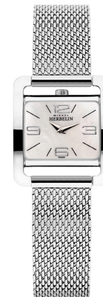
17137/19B Ø 25.5 x 19 mm