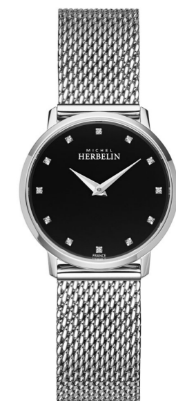
16915/44B Ø 30.5mm