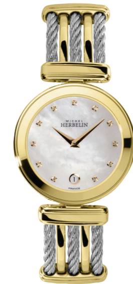
19415/BT59 Ø 31.5mm