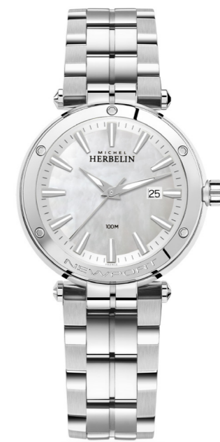
14288/B19 WR 100m Ø 34mm