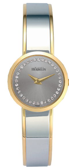
17056/BT62 Ø 28mm