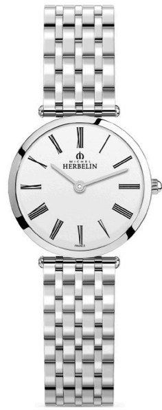
17116/B01N Ø 28mm

Swiss Movement - Quartz 316L - Stainless steel Sapphire Crystal Water resistant 30 m.