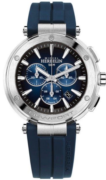
37688/35CB WR 100m Ø 43mm

Swiss Movement - Quartz 316 L- Stainless steel Sapphire Crystal Water resistant 100 m