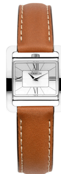
17137/08GO Ø 25.5 x 19 mm