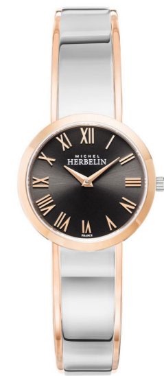
17056/BTR22 Ø 28mm