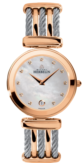
19415/BTR59 Ø 31.5mm