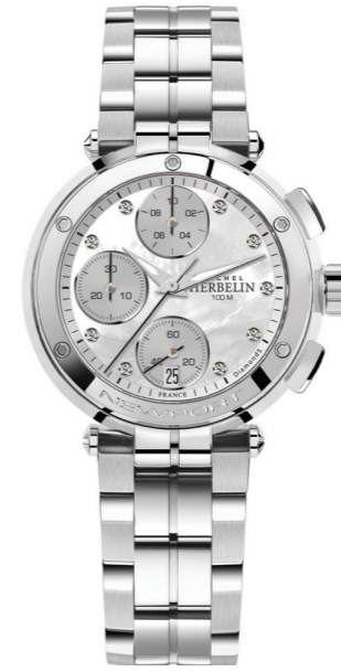
35688/B89 WR 100m Ø 34mm Diamond

Swiss Movement - Quartz 316 L- Stainless steel Sapphire Crystal Water resistant 100 m