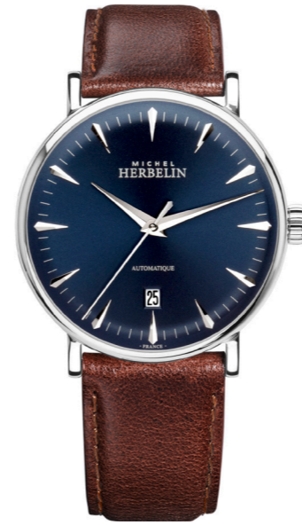
1647/AP15BR Ø 40mm

Swiss Movement - Automatic 316L - Stainless steel Sapphire Crystal Water resistant 30 m.