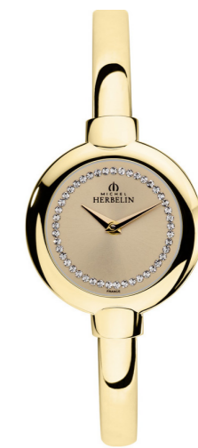
17413/BP63 Ø 26mm