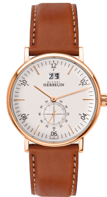
18247/PR11GO Ø 40mm

Swiss Movement - Quartz 316L - Stainless steel Sapphire Crystal Water resistant 30 m.