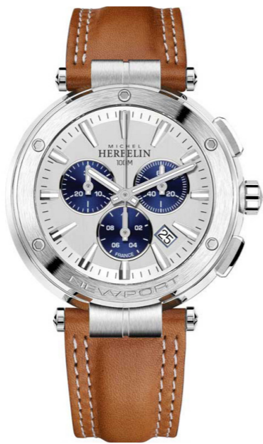
37688/42G0N WR 100m Ø 43mm