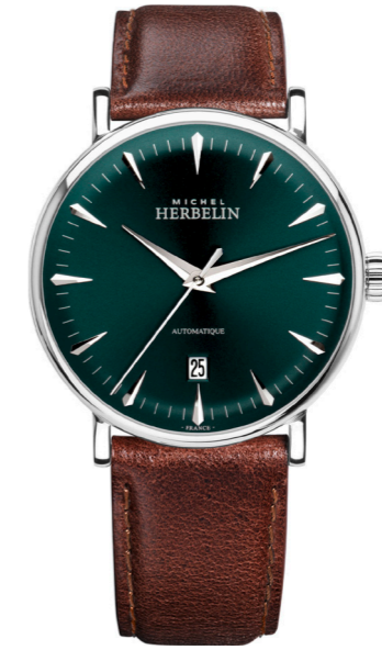
1647/AP16BR Ø 40mm