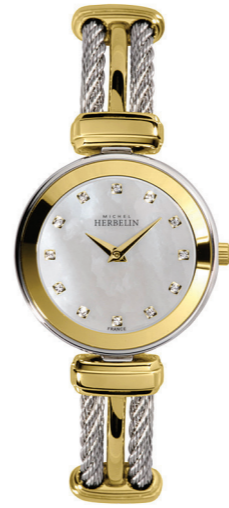
17125/BT59 Ø 26mm