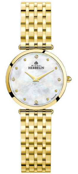
17116/BP89 Ø 28mm