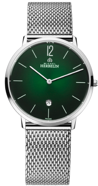
19515/16NB Ø 38.7mm

CITY | Swiss Movement - Quartz 316L - Stainless steel Sapphire Crystal Water resistant 30 m.