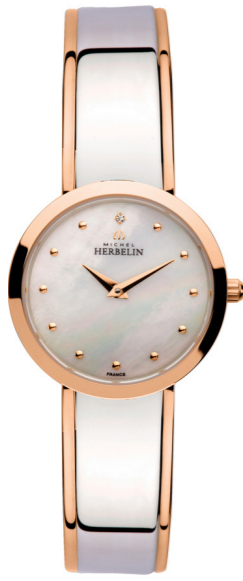
17056/BTR19 Ø 28mm