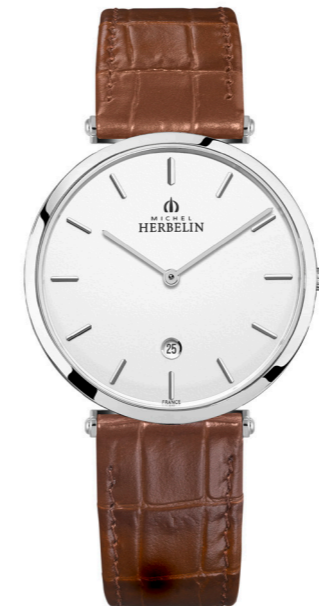
19406/11GO Ø 38mm