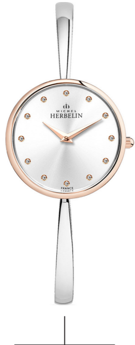
17418/BTR52 Ø 31mm

Swiss Movement - Quartz Stainless steel High Grade Gold PVD Sapphire Crystal Water resistant 30 m.