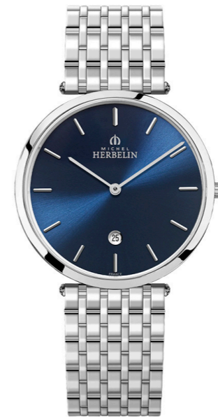
19416/B15 Ø 38mm

Swiss Movement - Quartz 316L - Stainless steel Sapphire Crystal Water resistant 30 m.