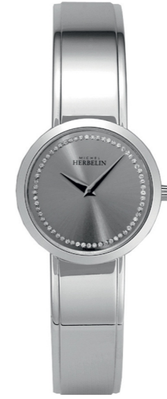
17056/B62 Ø 28mm

Swiss Movement - Quartz 316L - Stainless steel Sapphire Crystal Water resistant 30 m.