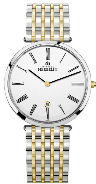
19416/BT01N Ø 38mm