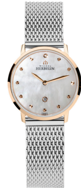
16915/PR59B Ø 30.5mm