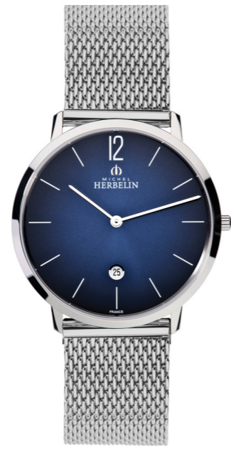
19515/15B Ø 38.7mm