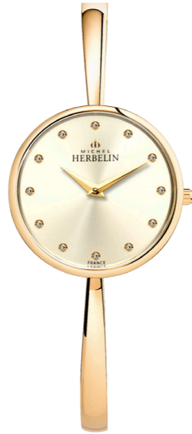
17418/BP53 Ø 31mm