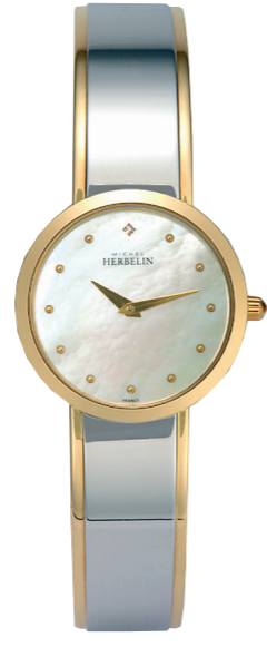
17056/BT19 Ø 28mm