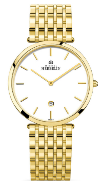
19416/BP11 Ø 38mm