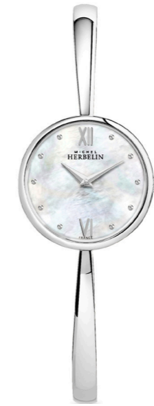
17408/B19 Ø 26mm