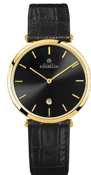
19406/P14N Ø 38mm