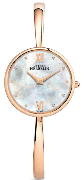
17418/BPR19 Ø 31mm