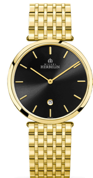
19416/BP14N Ø 38mm