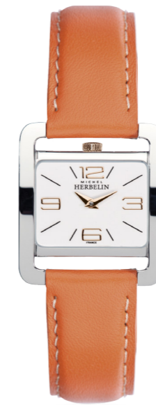
17137/TR11OR Ø 25.5 x 19 mm

Swiss Movement - Quartz 316L - Stainless steel Sapphire Crystal Water resistant 50 m Ø : 25.5 x 19 mm