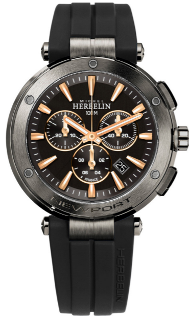
37688/G33TCA WR 100m Ø 43mm