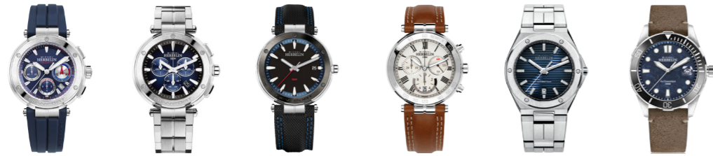
Newport Automatic 8 Newport Chrono 10 Newport Originals 11 Newport Classics 16 Cap Camarat 20 Trophy 21