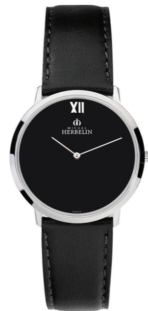
17415/04 Ø 36mm