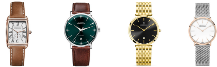
Art Deco 23 Inspiration 25 Epsilon 27 City 31