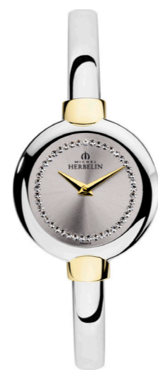
17413/BT62 Ø 26mm