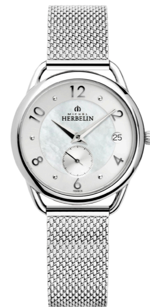
18397/29B Ø 34mm

Swiss Movement - Quartz 316L - Stainless steel Sapphire Crystal Water resistant 30 m.