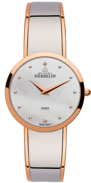
17082/BTR19 Ø 31mm

Swiss Movement - Quartz 316L - Stainless steel Sapphire Crystal Water resistant 30 m.