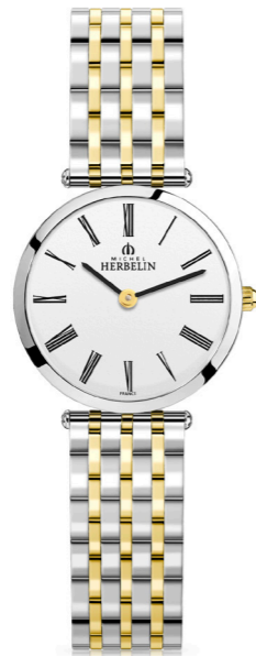
17116/BT01N Ø 28mm