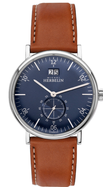
18247/15GO Ø 40mm