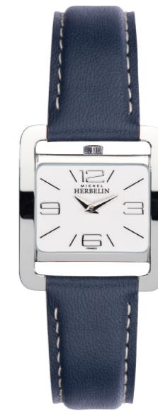
17137/11BL Ø 25.5 x 19 mm