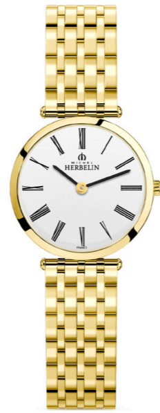
17116/BP01N Ø 28mm