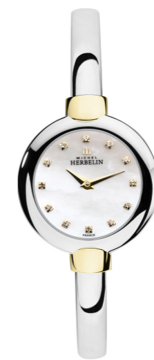
17413/BT59 Ø 26mm