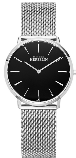
19515/24NB Ø 38.7mm