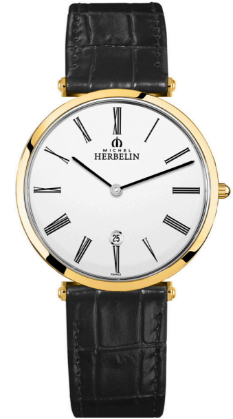
19406/P01N Ø 38mm