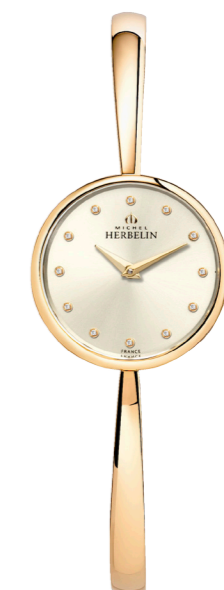
17408/BP53 Ø 26mm