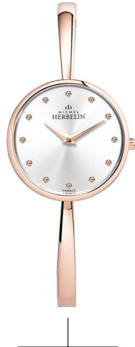
17418/BPR52 Ø 31mm