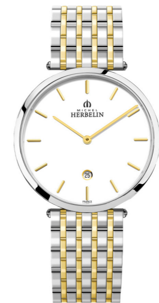
19416/BT11 Ø 38mm