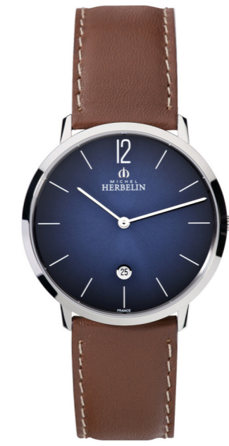
19515/15 Ø 38.7mm