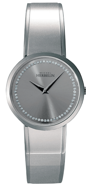
17082/B62 Ø 31mm