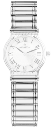
BRAC.17443/AP Roll bracelet