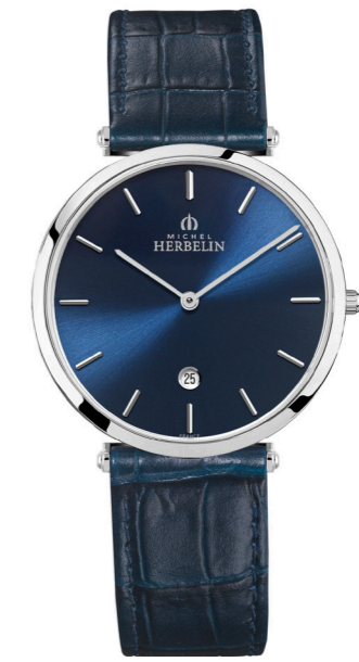
19406/15BL Ø 38mm